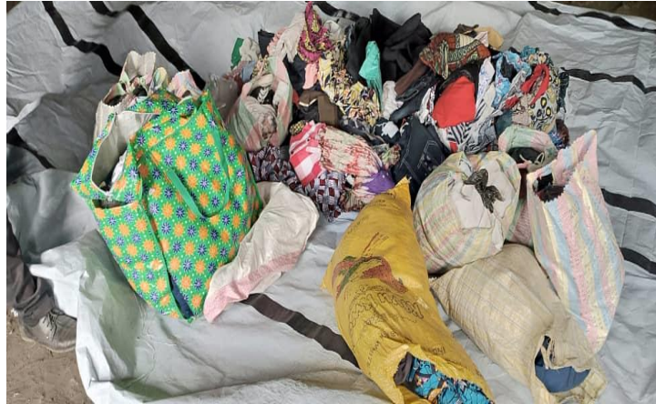
Clothes and shoes from Quakers in Goma