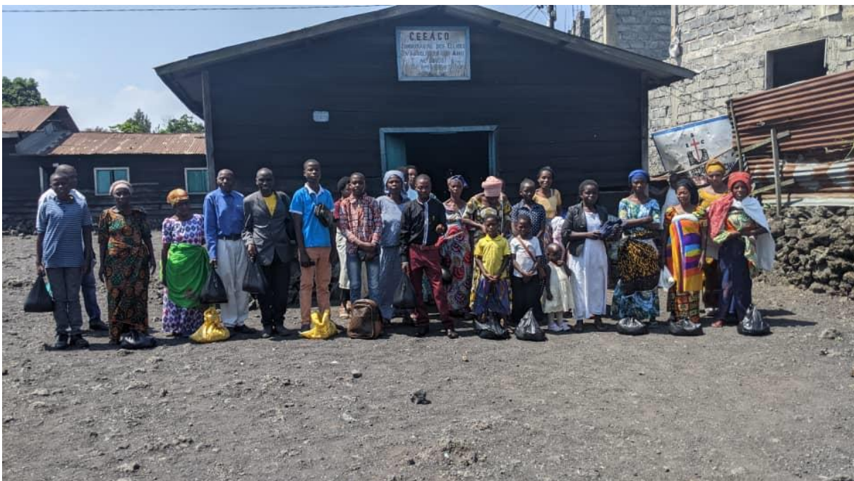
Some beneficiaries after distribution

Note: It should be noted here that apart from the Rice purchased by the fund from the Quakers in Great Britain, the Quakers of Goma collected clothes and shoes which were also distributed at the same time to the displaced people. Also, 80% of the beneficiaries were Quakers displaced in Goma and its surroundings and 20% displaced people of other beliefs (Catholics, Protestants, Muslims, etc.).