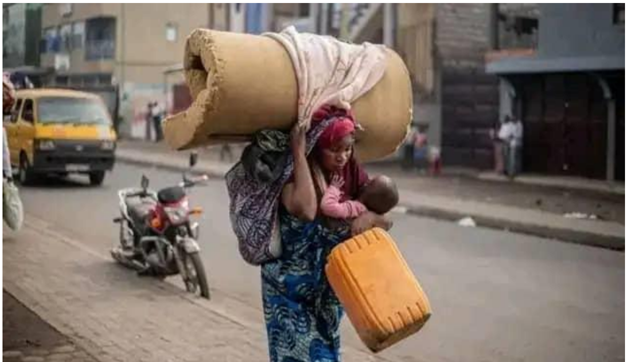
A woman who fled the violence, in Goma.

In North Kivu in the eastern Democratic Republic of Congo the rebel group M23 has forced many of the local population to flee their homes and farms to displaced persons camps around the town of Goma. The M23 are attempting to gain control of the mines in the region. There are about 77 Quakers families among those in the camps. Quakers from Goma have been giving them what support they can, but their resources are very stretched, and we have recently heard that M23 have taken Goma itself, and also Bukavu. Those in the camps are in need of food, tarpaulins for shelter, cooking pots, cutlery and crockery, clothes, school fees and equipment and other basic things.