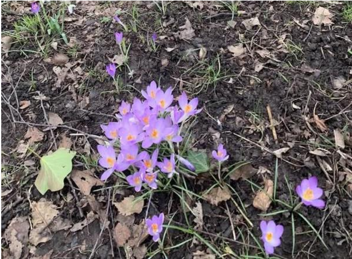
Spring in February in the little park on the New Barracks Estate, Salford