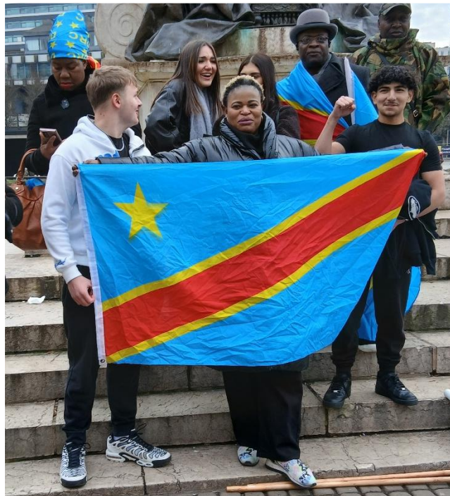
Demonstration in Piccadilly Gardens 17 Feb

If you would like some articles that show that it is generally known that Rwanda supports M23, despite Kagame's denials, please email me on elizcol@dialstart.net and I will send them.